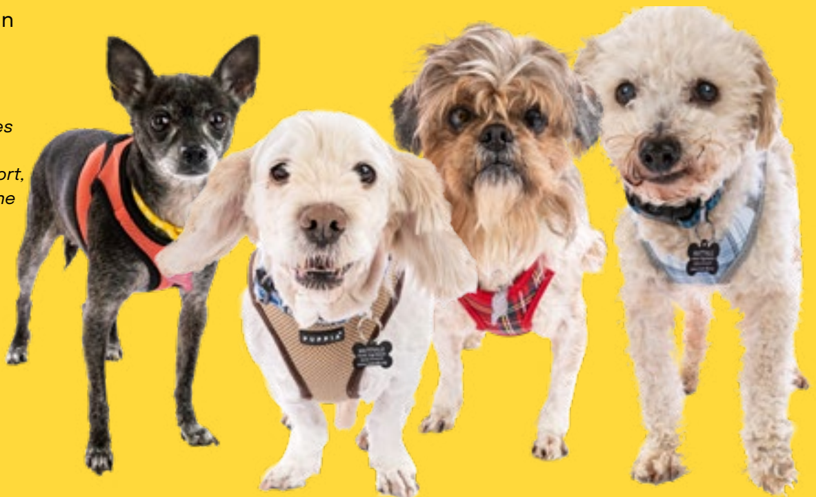
The last rescues of 2023: Brie, Stilton, Roquefort, and Mascarpone