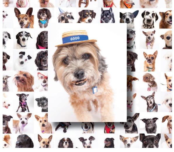
Poochini is the 6,000th dog rescued by Muttville! At the end of 2018, we had rescued 6,637 dogs.